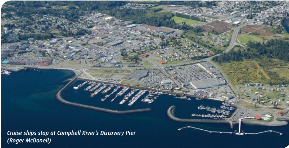
Cruise ships stop at Campbell River's Discovery Pier

interest—the undisputed focus of the city's peppy arts and culture scene—is the bright pink Tidemark Theatre. This heritage theatre is the setting of much of importance on Campbell River's social calendar, conventions included.