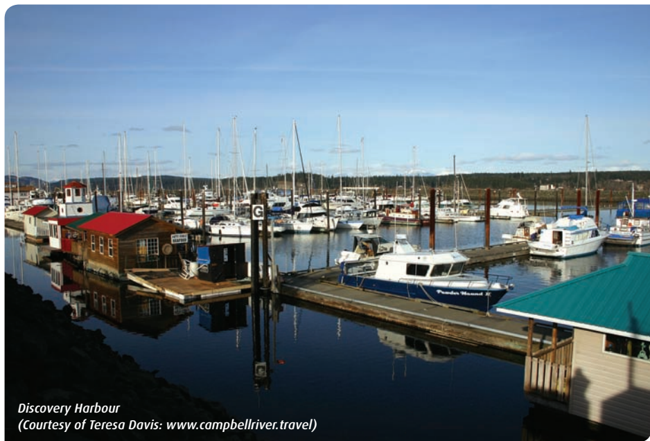
Discovery Harbour