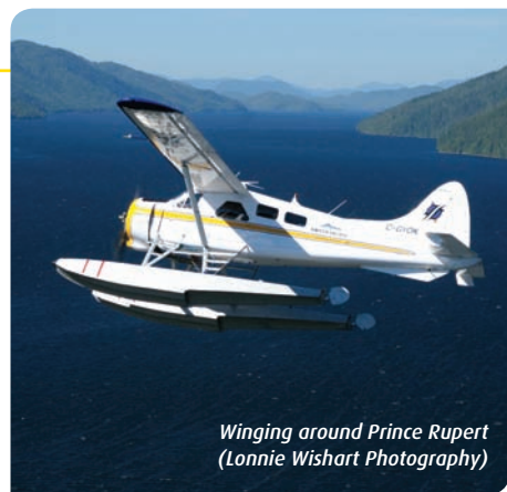
Winging around Prince Rupert

Whether you take it easy or go all out for action in Prince Rupert, your playground in this remote yet accessible destination is one of B.C.'s true miracles of nature. — David Morrison