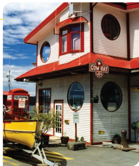
The Cow Bay Cafe in the quaint Cow Bay Shopping District

A compact city of some 13,000 inhabitants, Prince Rupert lies in a sheltered harbour in the heart of Tsimshian First Nations traditional territory. The monumental art of the Tsimshian is world famous and fine examples of their remarkable, lofty totem poles can be seen around the city, usually with tourists gathered at the bases, craning their necks in admiration.