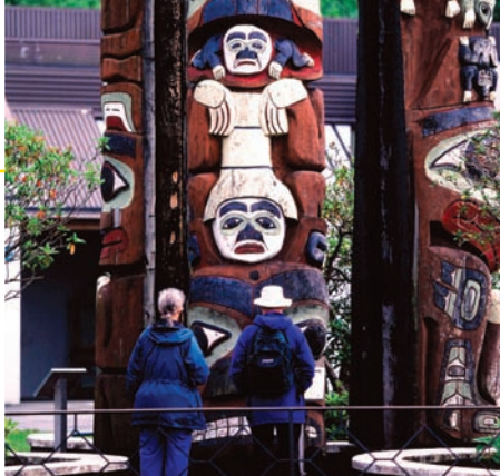
Visitors stand in awe of Prince Rupert's totems

The ocean, plus the beautiful lakes and rivers around Prince Rupert, offer some of the best sport fishing anywhere in Canada. "Our saltwater sport fishing is world class for all five species of salmon, as well as halibut, rockfish and shrimp," Wishart explains. People exclaim over