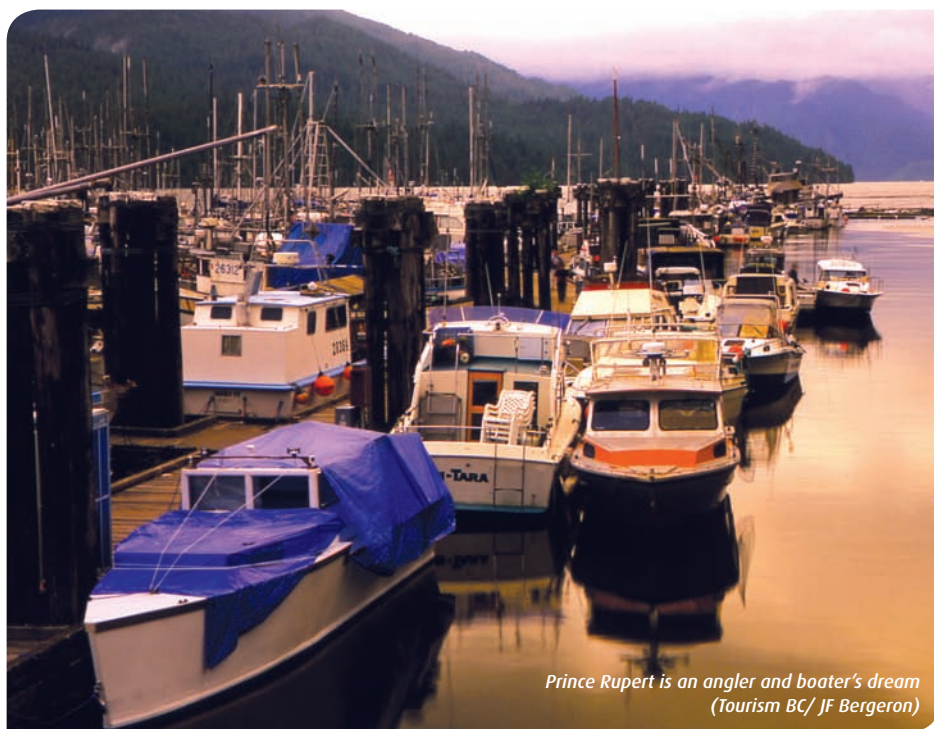
Prince Rupert is an angler and boater's dream

A concerted tourism drive has seen Prince Rupert become a popular stop for Alaska-bound cruise ships in recent years, the southern coast of the "Last Frontier" lying just 65 kilometres to the north. However, Prince Rupert is no mere whistle stop to pass through without a thought. Boasting 10,000 years of First Nations history, outstanding natural attractions and myriad opportunity for adventure, this is a boomtown demanding in-depth exploration.