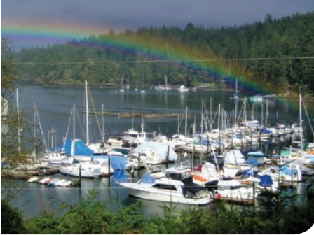
Activity centres around the marina and yacht club (Carol Messier)