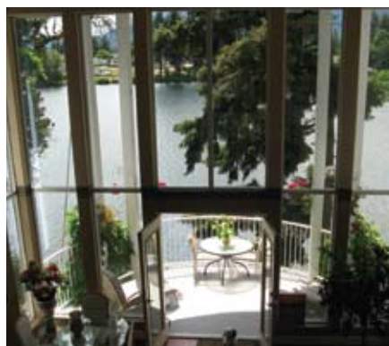
The Whitehouse's amazing main room windows from the lobby balcony.

Our suite—described as “the honeymooner’s choice”—was The First Lady’s Quarters. Opening out to the left from its door on the lobby balcony, this lovely room’s focus is an extremely comfortable king-size bed, adorned with a nest of cushions and pillows. Lush cream carpet runs throughout, floor tiles giving way at the bathroom transition. To the left of the bed there’s a three-seat black couch with its own nest of scatter cushions. Other features include glass-topped coffee and dining tables; a walk-in wardrobe large enough to create another room, and a TV/DVD/VCR combo cabinet of adequate spaciousness to also accommodate a microwave oven, refrigerator, toaster and everything needed to make hot beverages. The walls are jollied up by paintings, prints,