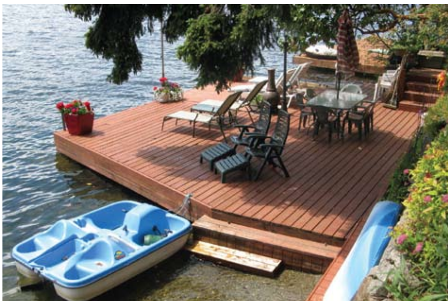
The Whitehouse's jetties.

softies) amused. And the cool retro design leopard head and zebra print cushion covers also turned my head.